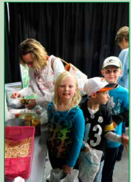
In April, children (and adults) had fun learning about wildlife habitats at EVLT's booth at GeoFest, sponsored by Estes Park Learning Place.

Also, within the next couple of weeks we expect to complete a conservation easement on another beautiful, 40-acre property in the Little Valley area. Stay tuned to our Facebook page and website at www.evlandtrust.org for updates on this and other exciting land conservation news in the Estes Valley!