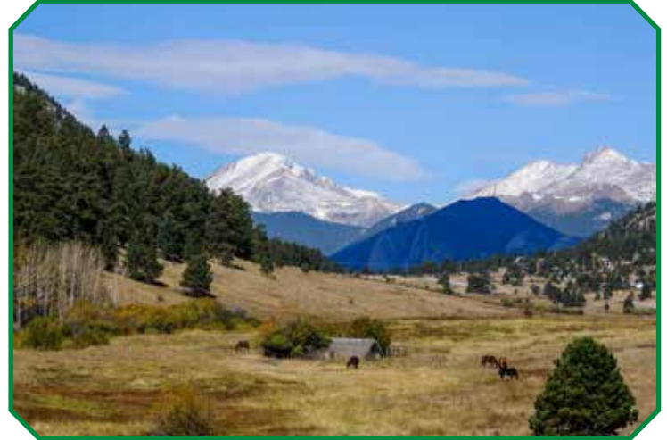
THE HIGHWAY 36 ENTRY TO ESTES...FOREVER PRESERVED