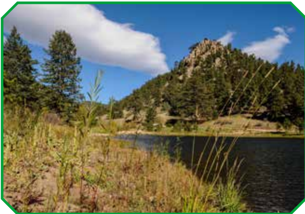
A SECLUDED POND TUCKED INTO THE MEADOWDALE HILLS.