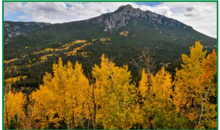
The Curry Conservation Easements protect important wildlife habitat, such as ponderosa pine woodlands and rock outcroppings that provide nesting habitat for raptors (left). The Currys' donation of conservation easements also ensure that a highly-visible forested flank of Twin Sisters Peaks will remain natural forever (right).