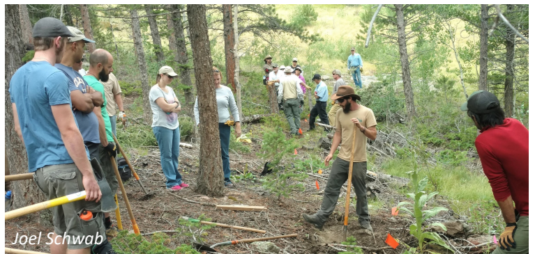
Larimer County employees and volunteers doubled the length of the Limber Pine Trail this summer.

Hermit Park is home to 8.5 miles of multi-use trails, 13 cabins, 86 camping/RV sites, and 5 equestrian campsites.