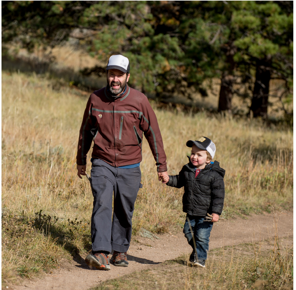
Amendments to allow hiking, where appropriate, enhance conservation values.

Protecting land for public outdoor recreation and education is also a common purpose for land trusts across the US. The Estes Valley Land Trust has a few local examples of conservation easements that specifically protect public access.