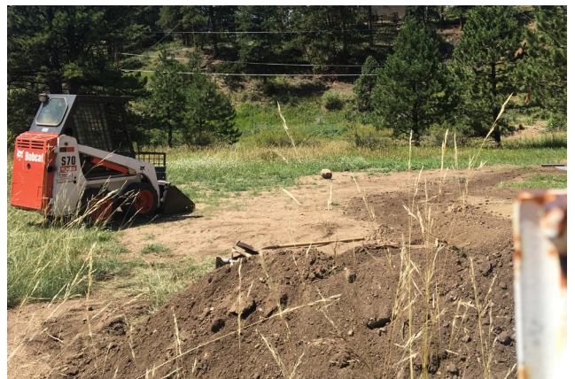
Damage observed to an EVLT eased property.

Monitors like Rick keep the Estes Valley beautiful and protected. Want to become a monitor? Contact us today!